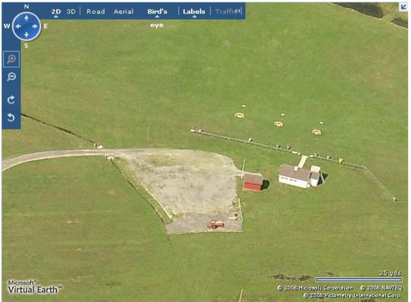
STARS Field Satellite photo